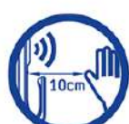
Auto Wake-Up 懸浮手動