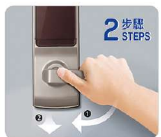
Traditional lock 2 steps (Turn and Push)