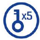
Mechanical Override Keys 機械鎖匙(後備)