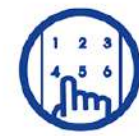
User Access Code 用戶密碼