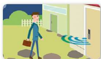
Detection performance depends on installation environment 安裝環境會影響懸浮感應的表現

Detect motion with 10cm and wake up the pad screen 10厘米懸浮感應，只需輕揮手掌，即可喚醒屏幕