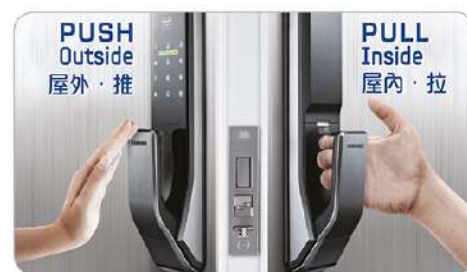
New lock 1 step (Just Push)