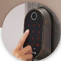
用戶密碼 User Access Code